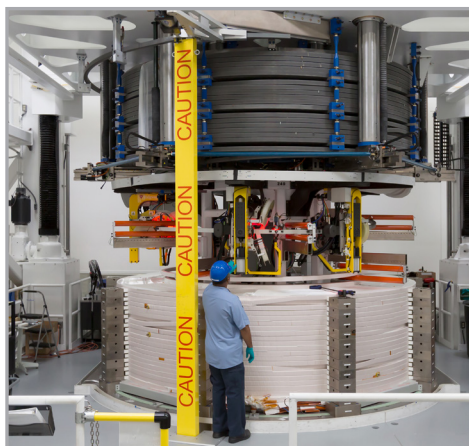
Turn insulation of a module.

The tooling needed to assemble the central solenoid was manufactured and component deliveries were completed in 2021.