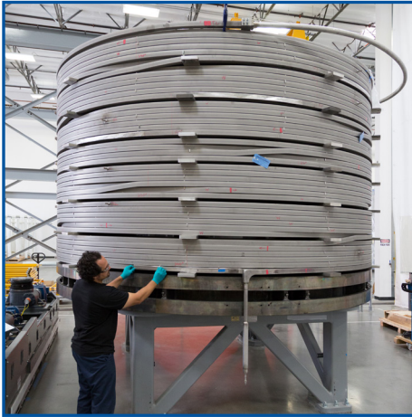
A module in the stack and join workstation.