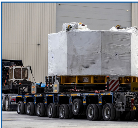
The first central solenoid module arrives at ITER.