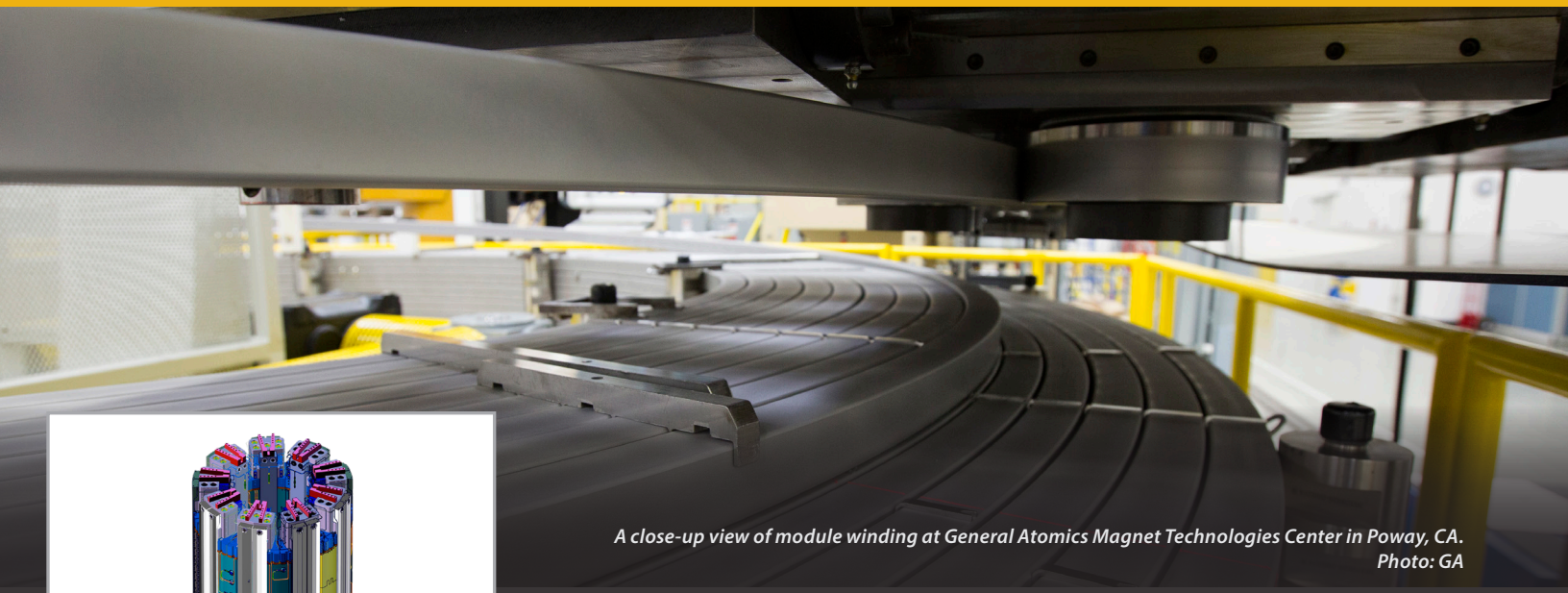
A close-up view of module winding at General Atomics Magnet Technologies Center in Poway, CA.